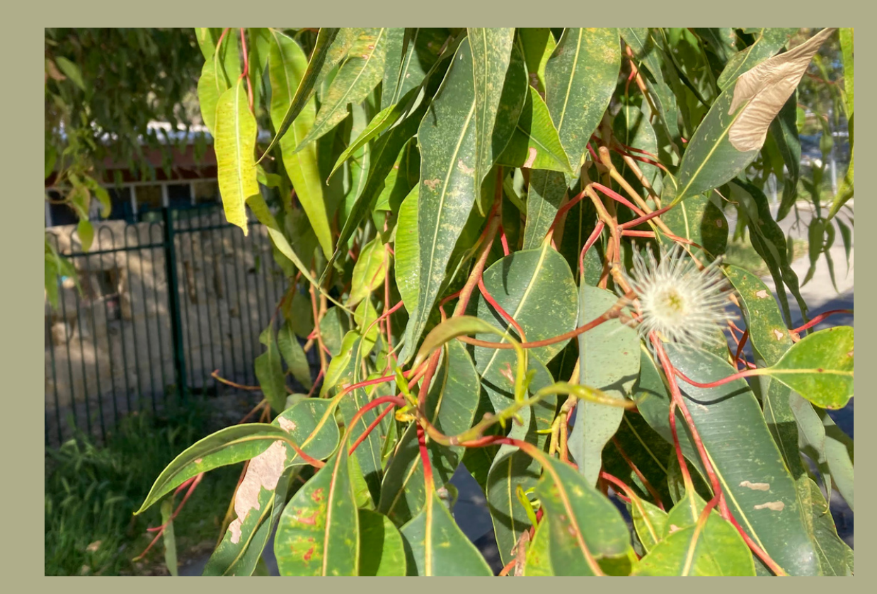
An early Marri flower blossom.

Kambarang brings more warm, dry days. Some of the small plants in our bushland have finished flowering and go dormant for the hot season, such as the donkey and cowslip orchids. Now some of the biggest plants - the Jarrah and Marri trees, will begin to flower. And watch out for Koolbardi the Magpie as he swoops to defend his babies!