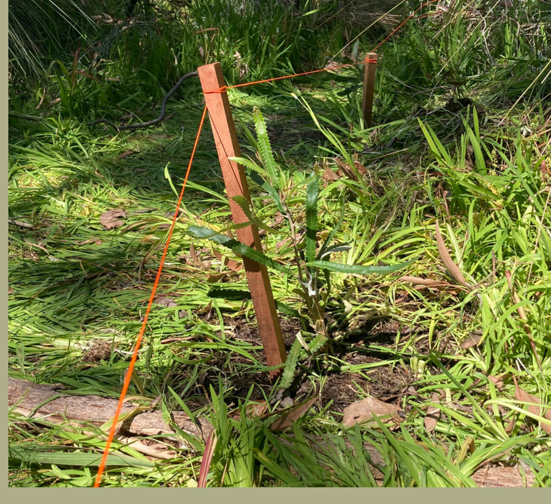
Banksia seedling, surrounded by trampled freesias.

The UP students had to weed out lots of Freesias to clear space for the trees they planted. Freesias have a fan of flat, green leaves up to 40 cm high with trumpet-like cream, white, yellow or purple flowers in spring. They die back each summer to an underground corm. The fragrance from them causes headaches for some people.